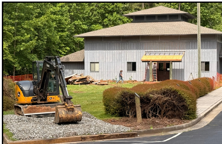
WEEK 1, June 1, 2026

Work has begun on the new office addition!